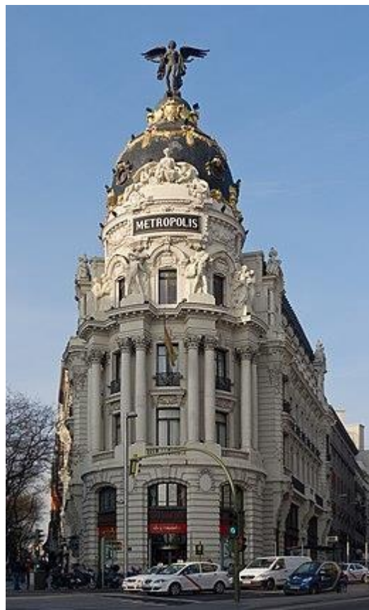
The Metrópolis Building is a building in the city of Madrid, Spain.

The Instituto Cervantes is the public body created by Spain in 1991 to promote and teach the Spanish language and the co-official languages and to disseminate Spanish and Latin American culture. It is present in 90 cities and 43 countries on five continents.