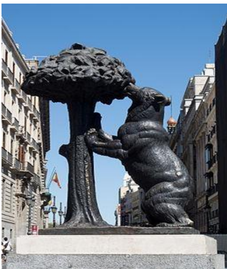
The bear and the strawberry tree