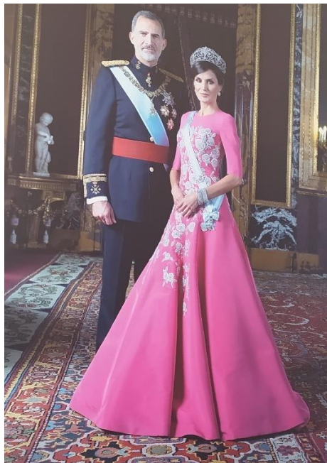
King Felipe VI and Queen Letizia

The Royal Palace in Madrid is the official residence of the King of Spain. The current King and Queen do not reside here, but in the Zarzuela Palace. The Royal Palace is used for ceremonies.