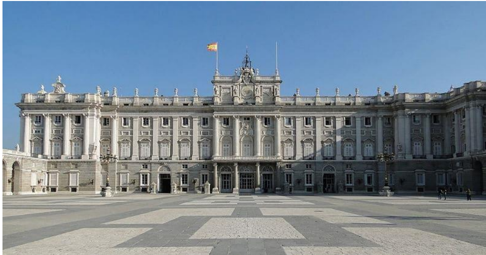
Royal Palace of Madrid

The Royal Palace in Madrid is the official residence of the King of Spain. The current King and Queen do not reside here, but in the Zarzuela Palace. The Royal Palace is used for ceremonies.