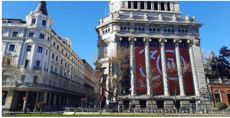
Cervantes Institute, Madrid

The Instituto Cervantes is the public body created by Spain in 1991 to promote and teach the Spanish language and the co-official languages and to disseminate Spanish and Latin American culture. It is present in 90 cities and 43 countries on five continents.