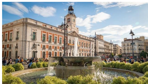
The Sun Gate