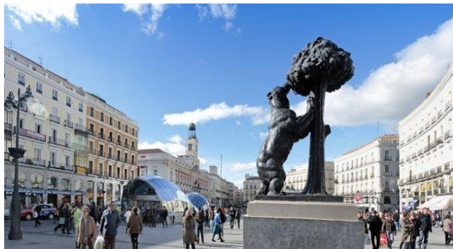
The Bear and the Strawberry Tree

We went to the Puerta del Sol square to play an escape game, using phrases and clues given to us by our teacher to find the name of the monument in question.